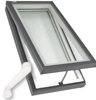
Crank handle included