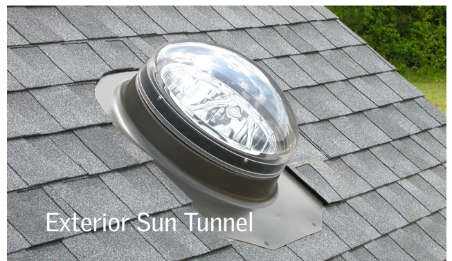
Exterior Sun Tunnel

A skylight is a window that mounts on the roof to bring in natural light and fresh air to your home. When adding a venting skylight this gives you the ability to properly release hot air and humidity from kitchens, bathrooms and top of stairs. Skylight installation may be either a Deck Mount or Curb Mount. With a skylight you enjoy privacy and an unobstructed view to the sky.